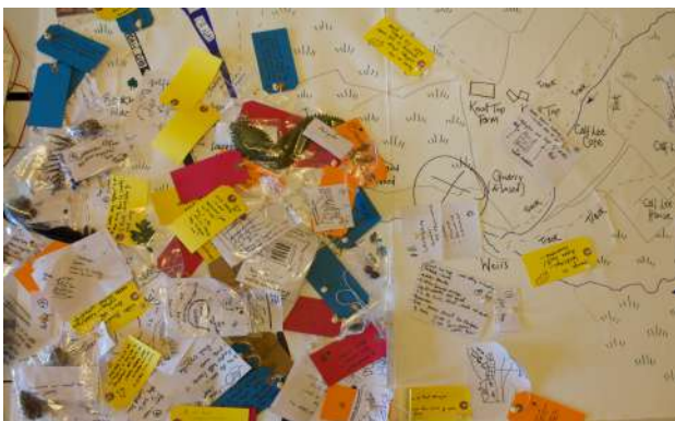
Figure 2. Data produced by the participants of the data walk.

No guidelines were given as to how they should respond and as a result a rich array of drawings, text, questions and found objects were collected.